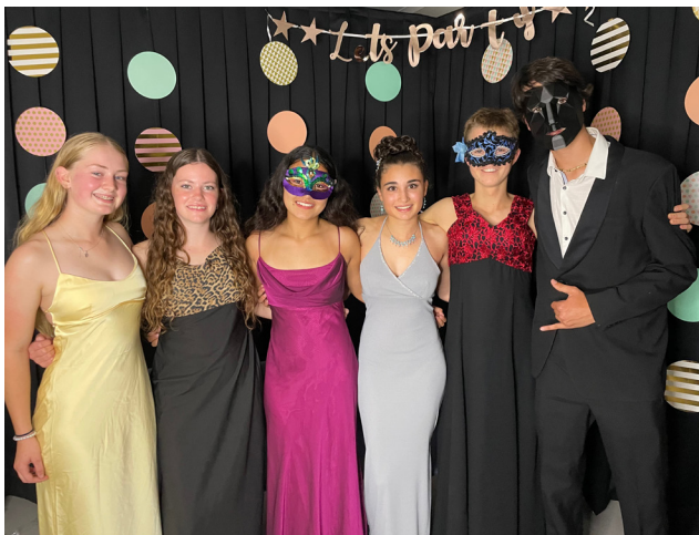
SRC Summer Soiree