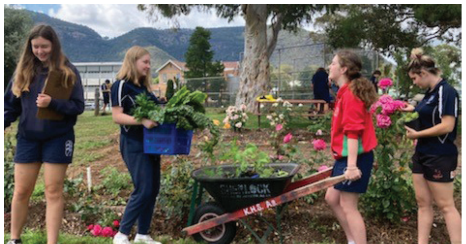
Year 9/10 Agriculture girls heading off to sell fresh produce harvested from the Ag plot.